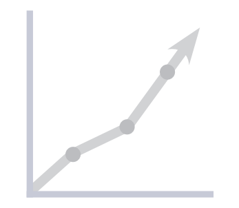
EVIDENCE-BUILDING AND EVIDENCE-BASED APPROACHES ARE CRITICAL FOR FUTURE SUCCESS

The useful example of a complementary institutional effort is the RESOLVE network. This brings together a network of international researchers who contribute to research on violent extremism and evaluation. The mission of the network is to 'connect, capture, curate, and catalyse locally informed research on violent extremism to promote effective policy and practice.'<sup>44</sup> The network shares publications and other documentation through a dedicated website. Importantly, it already recognises the value of focusing on matters relating to local communities, as well as those relating to broader structural matters including governance. Networks of this kind are challenged, however, by the complexities of feeding research evidence into policymaking and ultimately into operational practices. This speaks again to the need, as described above,